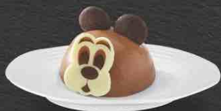
Kid's Bear 6 Chocolate gelato decorated with chocolate ears and face