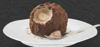
Chocolate Truffle 8 Zabaglione semifreddo surrounded by chocolate gelato and caramelized hazelnut, topped with cocoa powder