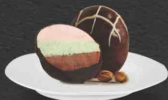
Spumoni Bomba 9 Strawberry, pistachio and chocolate gelato all coated with chocolate and drizzled with white chocolate