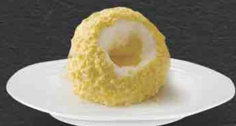
Limoncello Truffle 8 Lemon gelato made with lemons from Sicily, with a heart of limoncello, covered in meringue