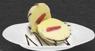
Exotic Bomba 9 Mango, passion fruit and raspberry sorbetto, all covered in white chocolate