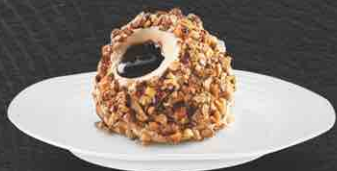
Hazelnut Truffle 8 A core of dark chocolate embroidered by hazelnut gelato covered with praline hazelnut and meringue